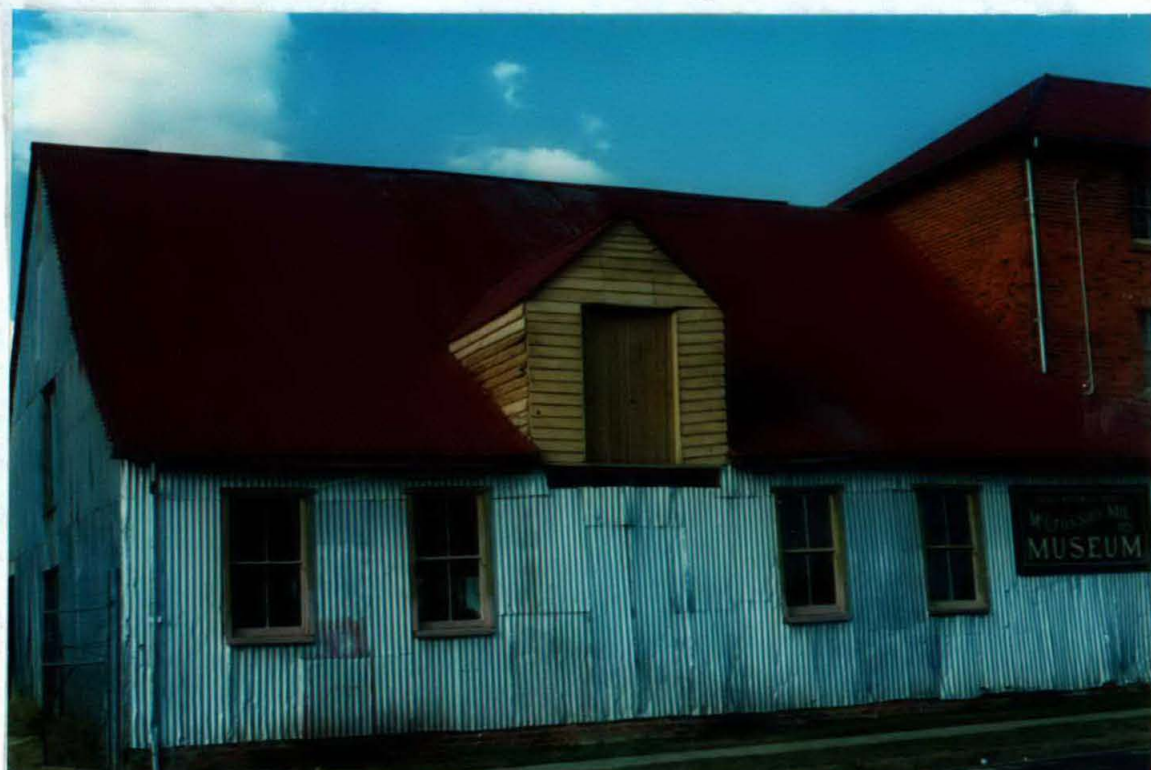
1. The Chaff shed, adjacent to McCrossin's Mill, Uralla.